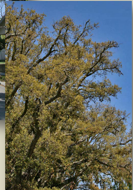
Cork oak ( Quercus suber )