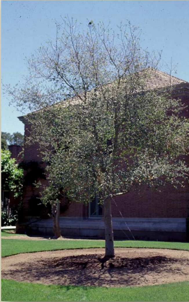
Leaf drop after transplanting