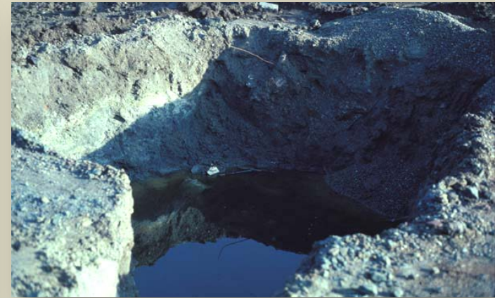
Esprit Park, SF