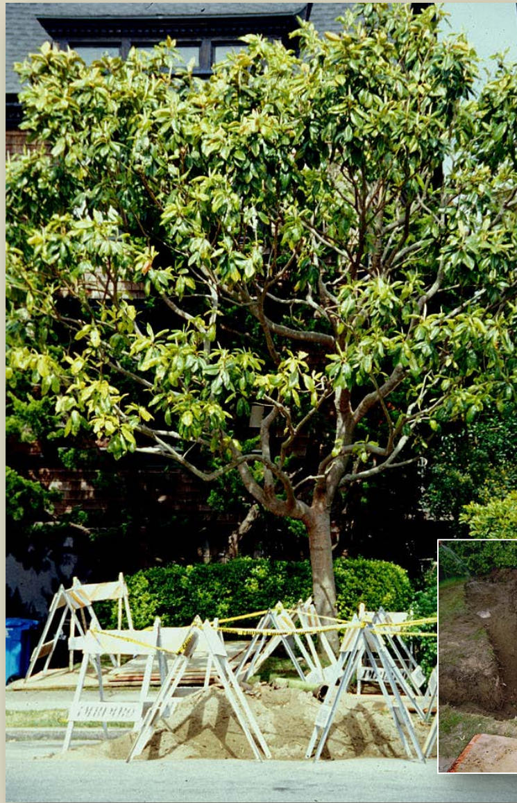
Magnolia grandiflora before trenching...