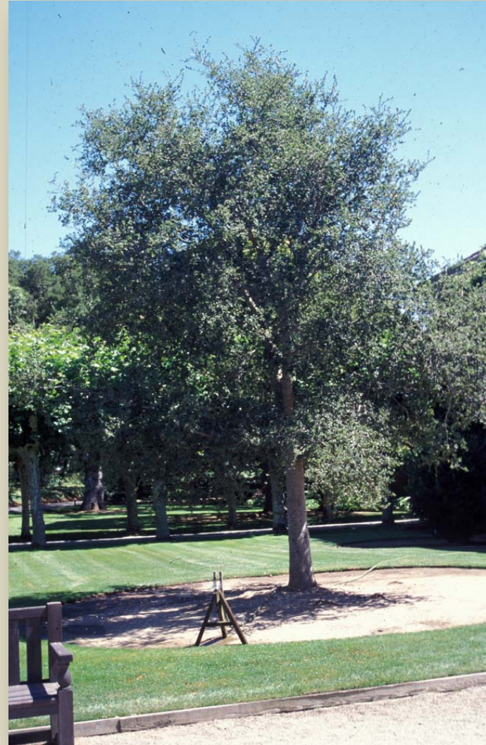
...regrowth 3 years later