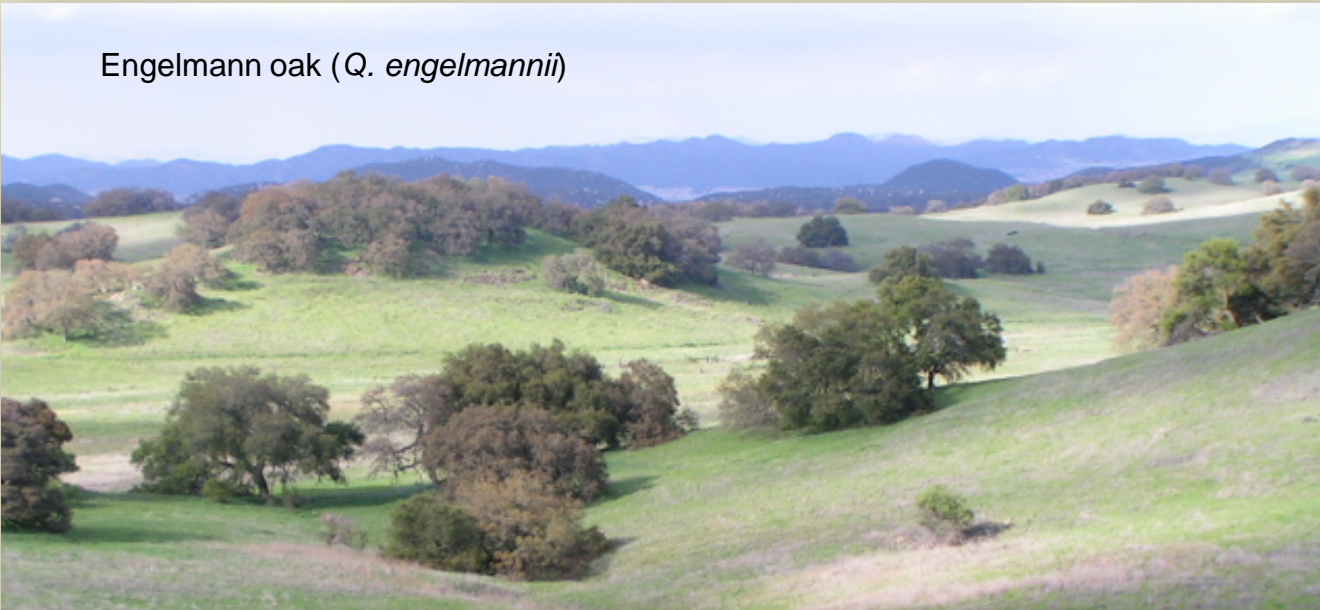
Engelmann oak ( Q. engelmannii )

Many species perform well without summer irrigation