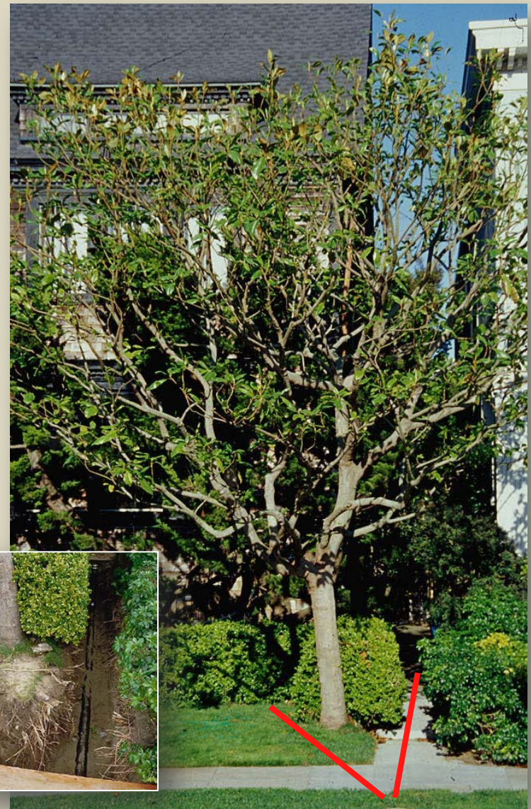
...and 3 months after trenching.