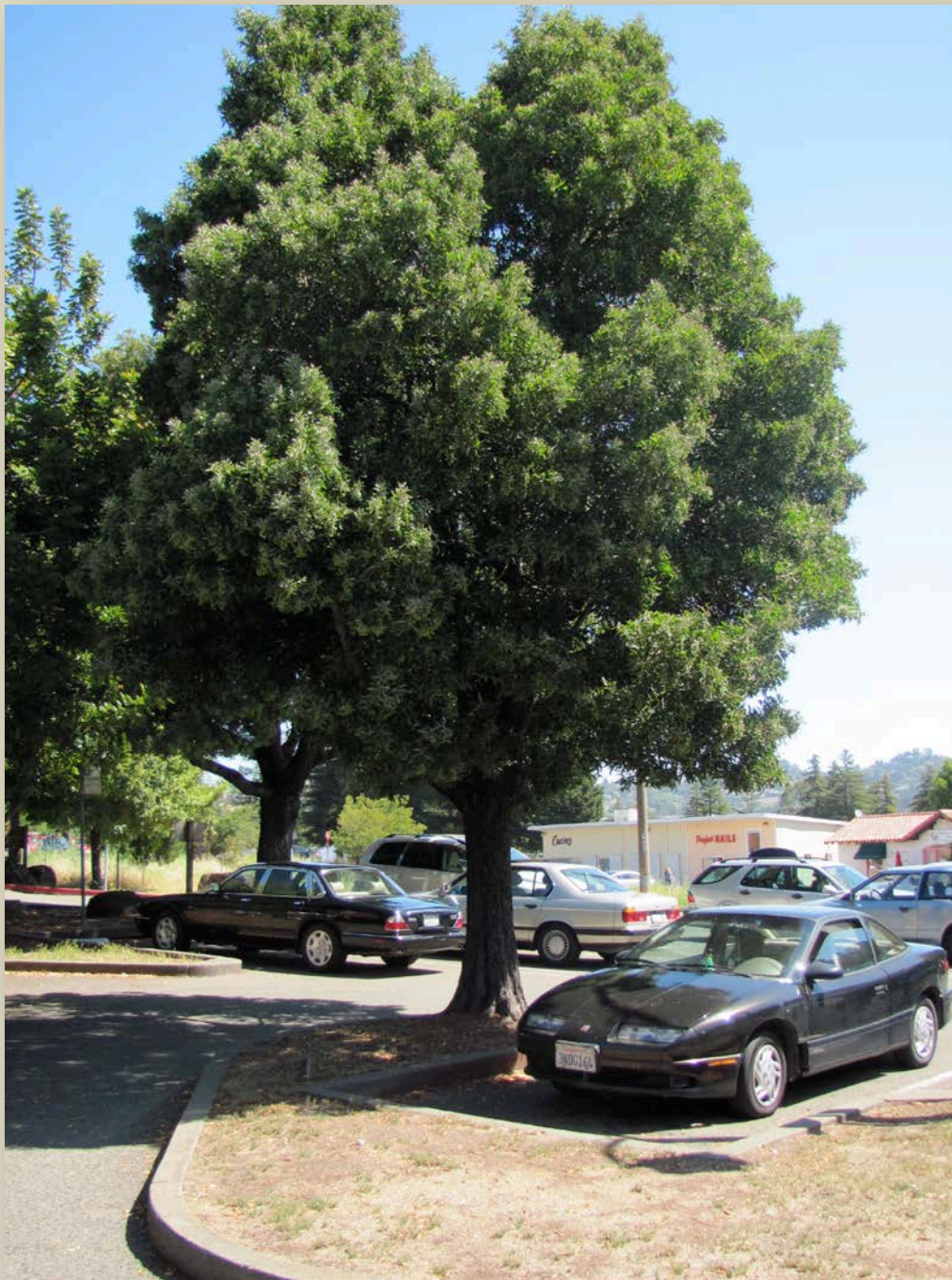
Blackwood acacia ( Acacia melanoxylon )